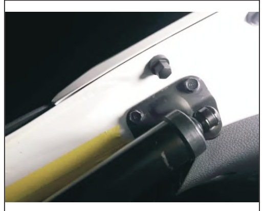
2. Remove the original car, poles in the original car bracket to install poles, attention should be someone the door up in their hands