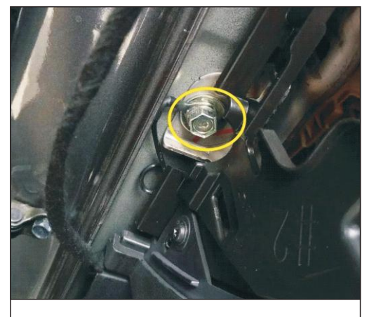
12. Connected to ground