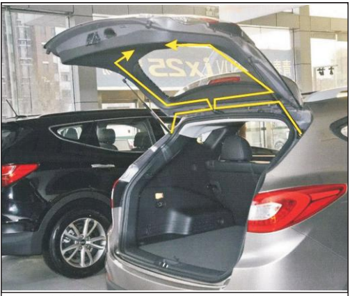
7. Hall line running from the hole through the waterproof rubber plug, go line to end door cover central control box, to thrust control boxes, as shown