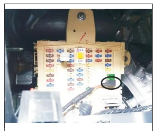
10. With our power plug