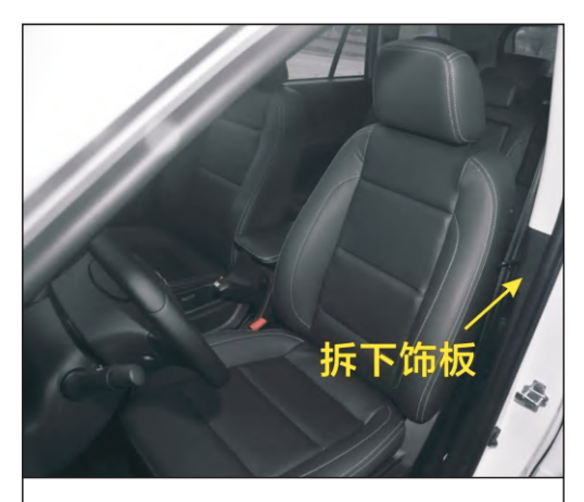
13. In the main drive belt B column place to remove the plaque, find the control