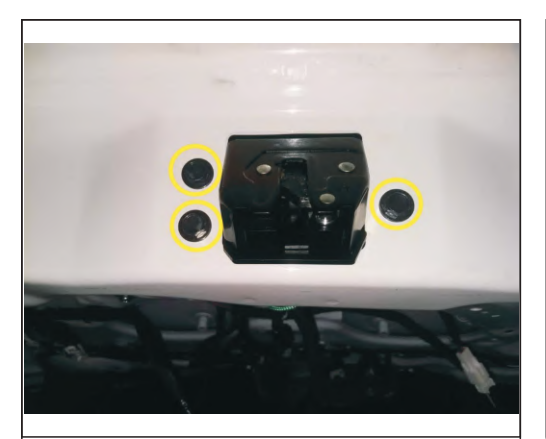
16. Remove the original car door lock, installed on our electric lock, use the original car screws