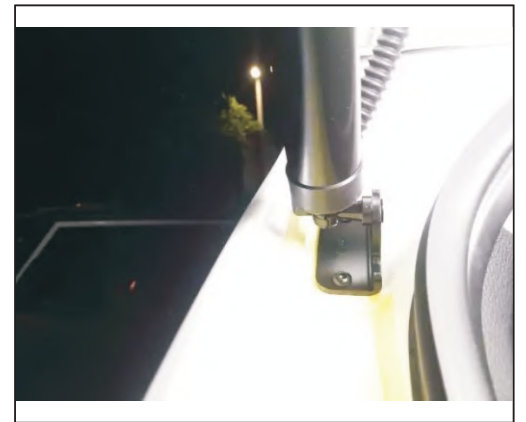
3. Remove the original car bottom bracket, installation, bottom bracket, with screws, install poles (with line down at the end of the poles)