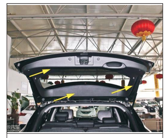
1.\,Remove the original rear door trim