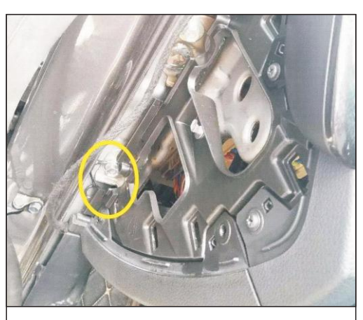
11. In the main drive side trim will be removed, find the ground