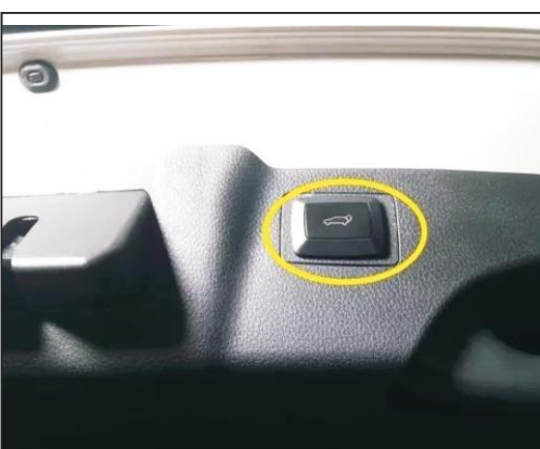
17. At the tail door trim remove square trim punch, install our stern door switch button