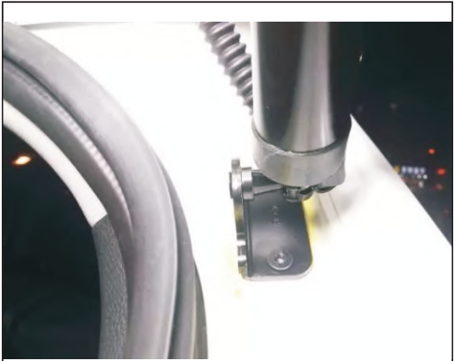
5. Remove the original car right bracket, installation bracket at the lower right, using screws, install the poles