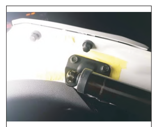
4. In the original car right bracket installation we poles