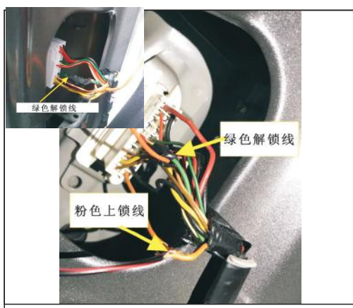
14.Our yellow lines to Central Line after the seat green unlock (from left to right the second row third bits) Pink line lock line answer the yellow line