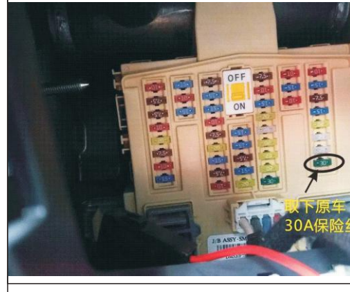
9. Remove the original car 30 a fuse