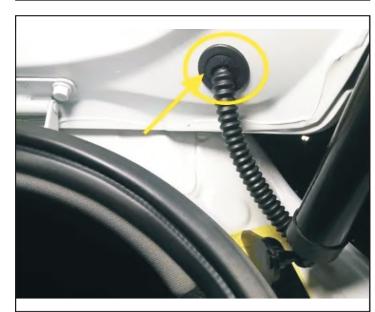
6. Will take off, the original car stopper on the reserved hole through the hole line from now on, rubber plug on the card