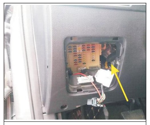
8. Remove the trim at the bottom of the main drive, found the power supply, as shown