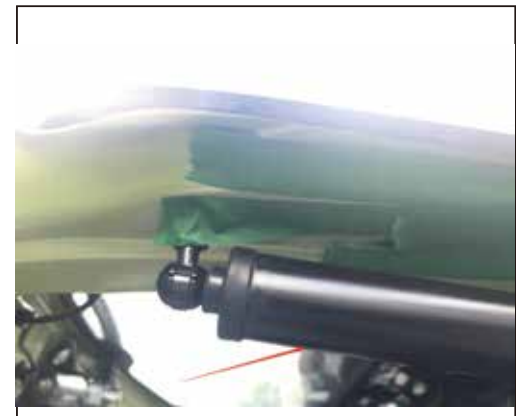
6. Install our right electric pole with the original car ball mount