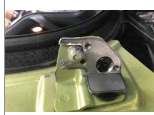
3. Insert our left and right brackets on the original car bracket