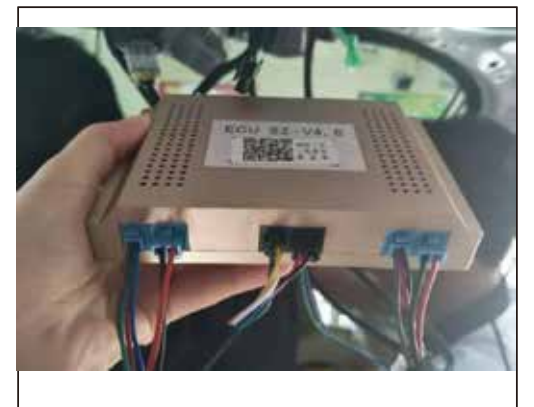
16. Hall wire, central control wire, power wire according to color insert one by one to control box