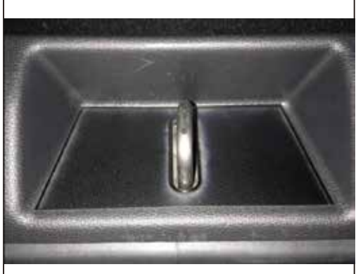
14.Remove the original car trim panel and install the lower lock hook