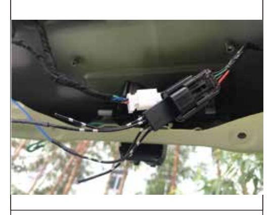
13. Connect electric suction lock plug to socket