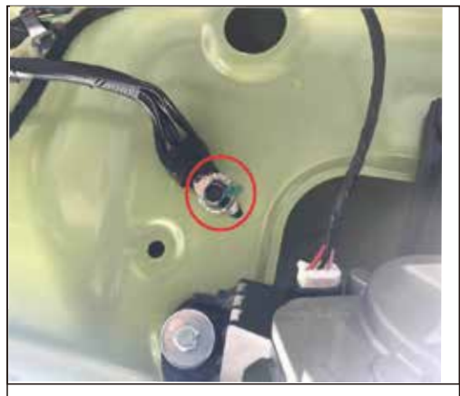
11.Grounding at tailgate of original car