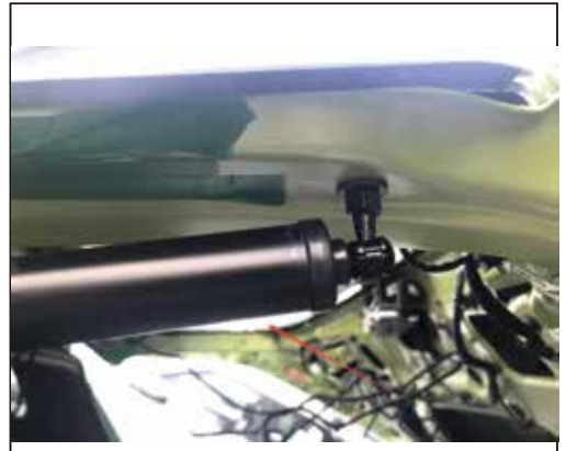
5. Install our left electric pole with the original car ball mount