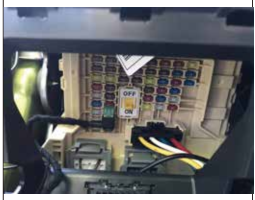
8. Draw power in the original car driver compartment