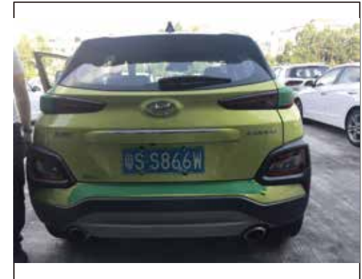
18.Install tailgate switch, restore car

After the installation is completed, you must set up the tailgate programming settings. Make sure that the doors are closed in place.