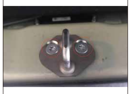
15.Install our lower locking hook and fix it with our screw