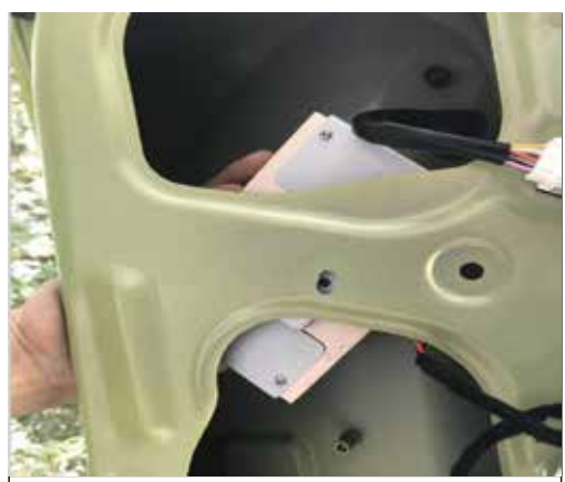
17.Install the control box at the original car tailgate. Fixed with our screw.