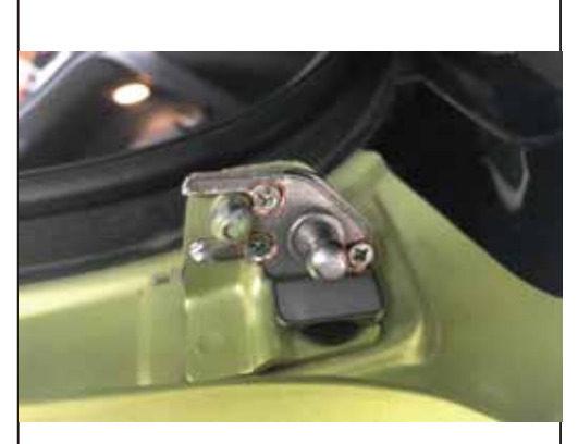
4. Fix with our screws, left and right brackets