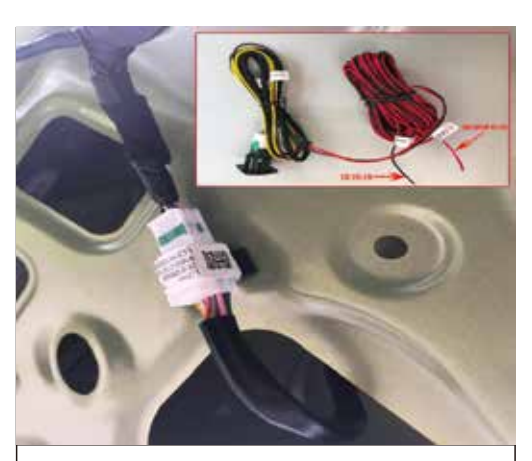
10. Connect three-way socket