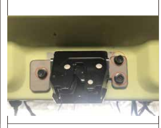
12.Remove the original lock and install our suction lock. Then, fixed with screw.