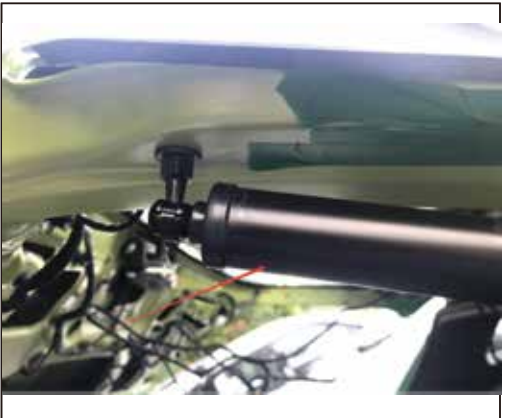
2. Remove the original car right support strut