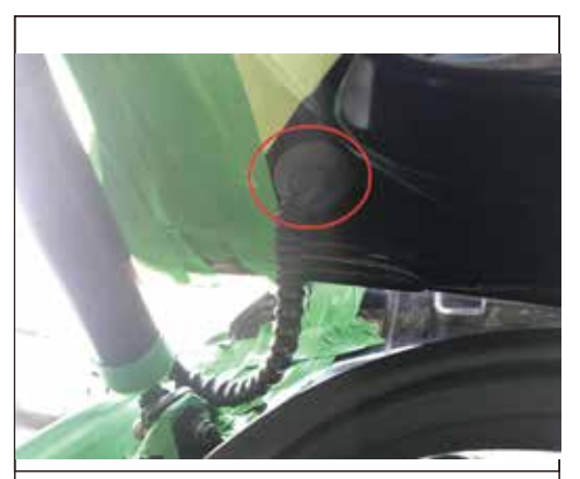
7. Position of electric pole wiring alignment