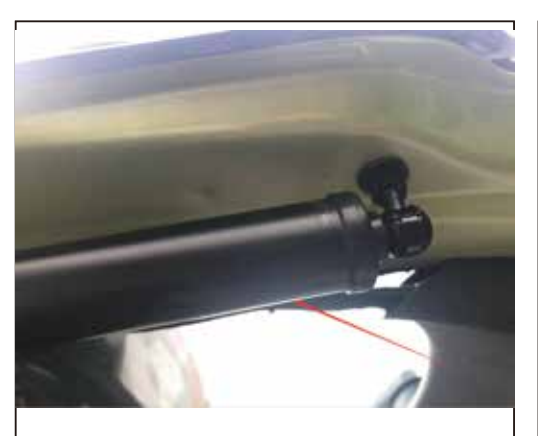
1. Remove the original car left support strut