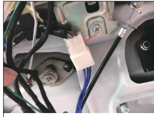
8. Connect three-way cable