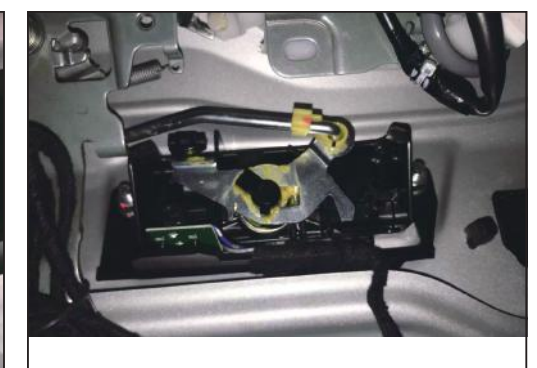
9.Remove the mechanical lock of the original car and install the tail door specially designed by our company Switch key, fixed with original screw