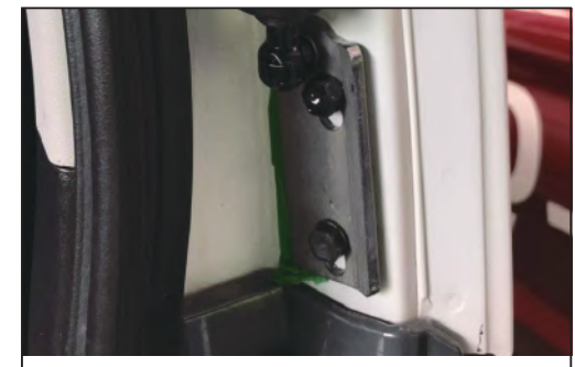
3.Remove the right lower bracket of the original car and install our special bracket