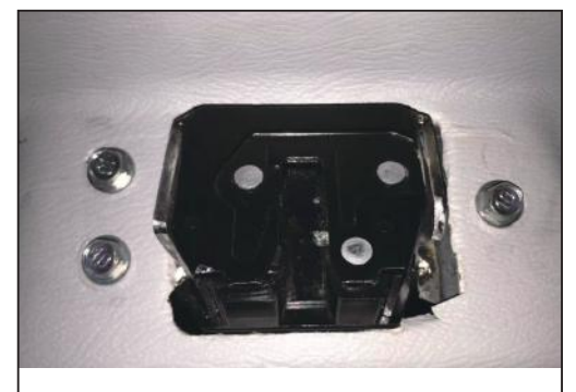
10.Remove the original locks and install our electric suction locks. Fixed with screw