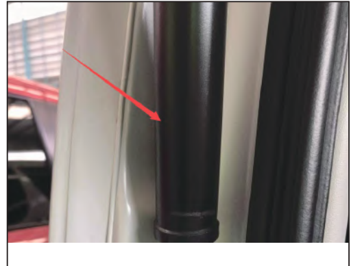
1.Remove the left and right braces of the original car