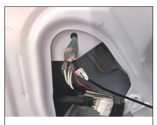
7. Grounding at the rear box reserve box