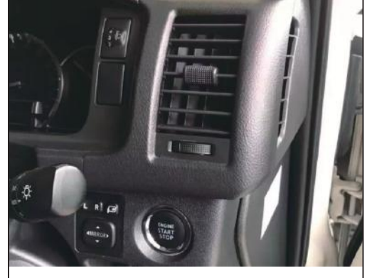
11.Installation of Driving Down Hole by Original Owner Tail door switch