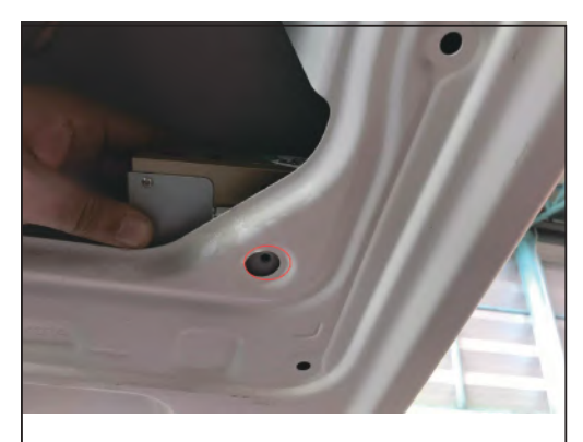
12. The control box is mounted at the rear of the car with screws. Gasket fixation