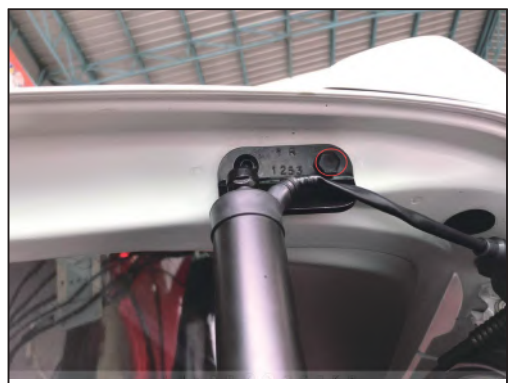
5.Remove the right upper ball head of the original car and install it. Our company specializes in it. The bracket is fixed with our screw