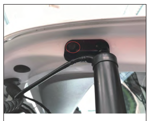
4.Remove the left upper ball head of the original car and install it. Our company specializes in it. The bracket is fixed with our screw