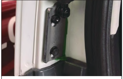
2.Remove the left lower bracket of the original car and install our special bracket